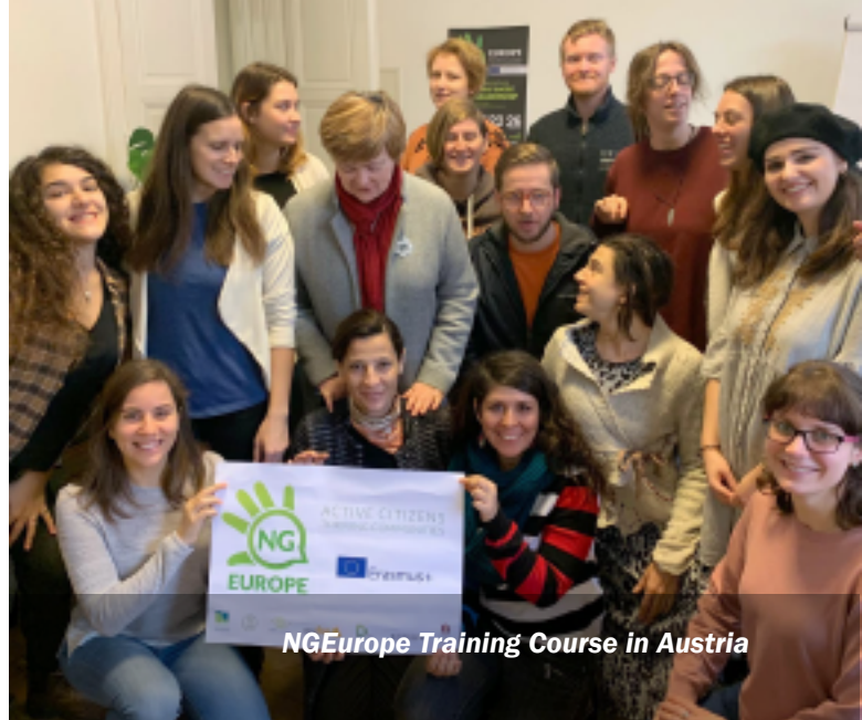
NGEurope Training Course in Austria

The final training course of the NGEurope project took place in Austria and started off with a field trip to a local NGO, Lerncafe Eggenberg, which offers after school care and educational support for children. Following on from the NGO visit, In the evening of the first course day, course trainers and participants were hosted at a private reception in the town hall of Graz.